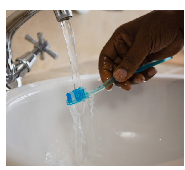
I rinse off my toothbrush