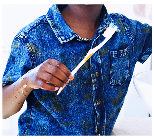
I get my toothbrush