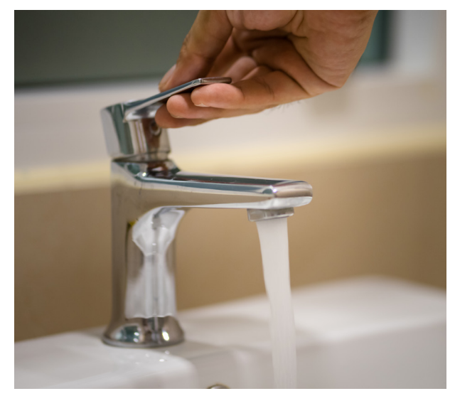
I turn on the water