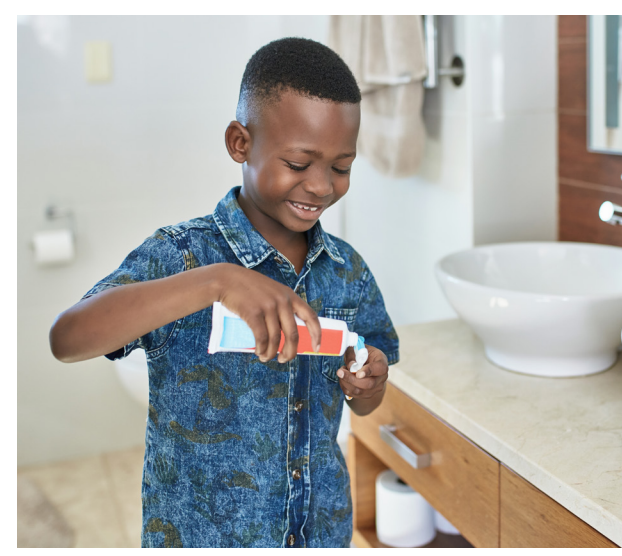
I put toothpaste on my toothbrush