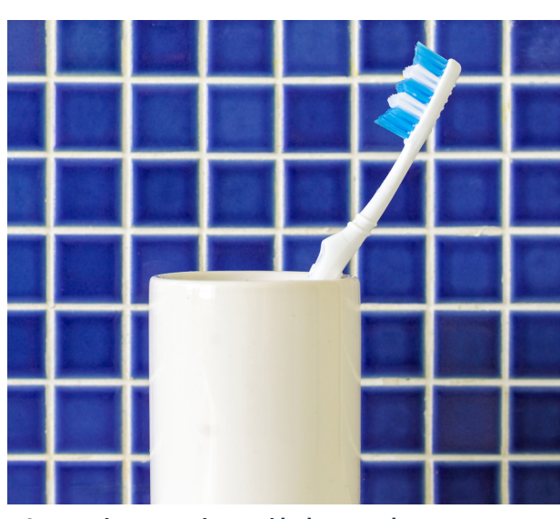
I put my toothbrush away