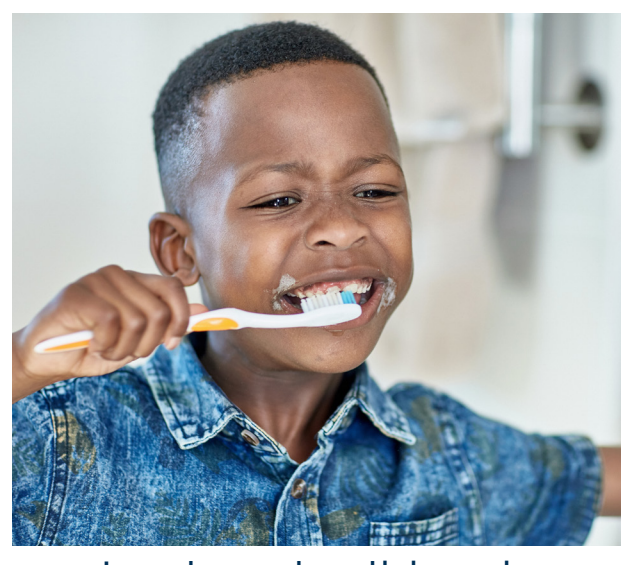
I put my toothbrush on my teeth and brush