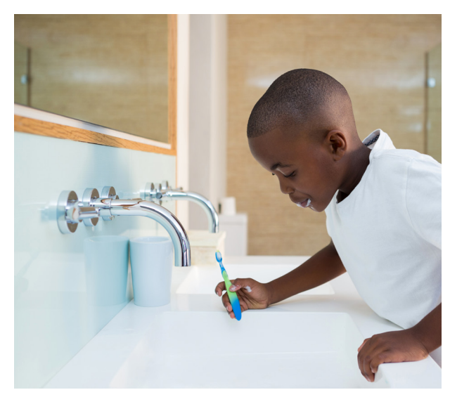
I spit out toothpaste in the sink