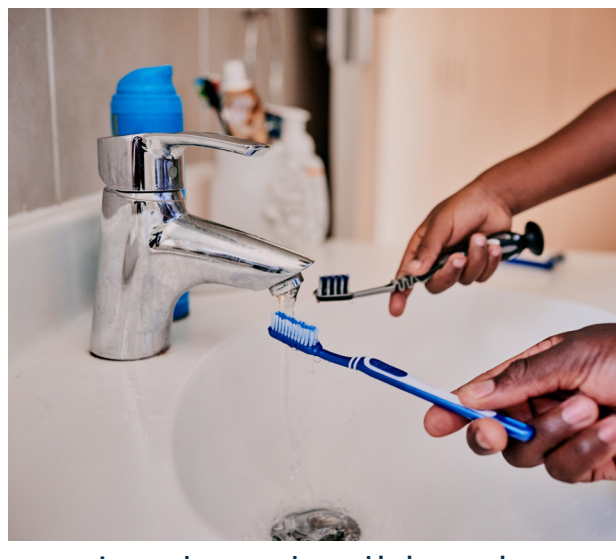
I put my toothbrush under the water